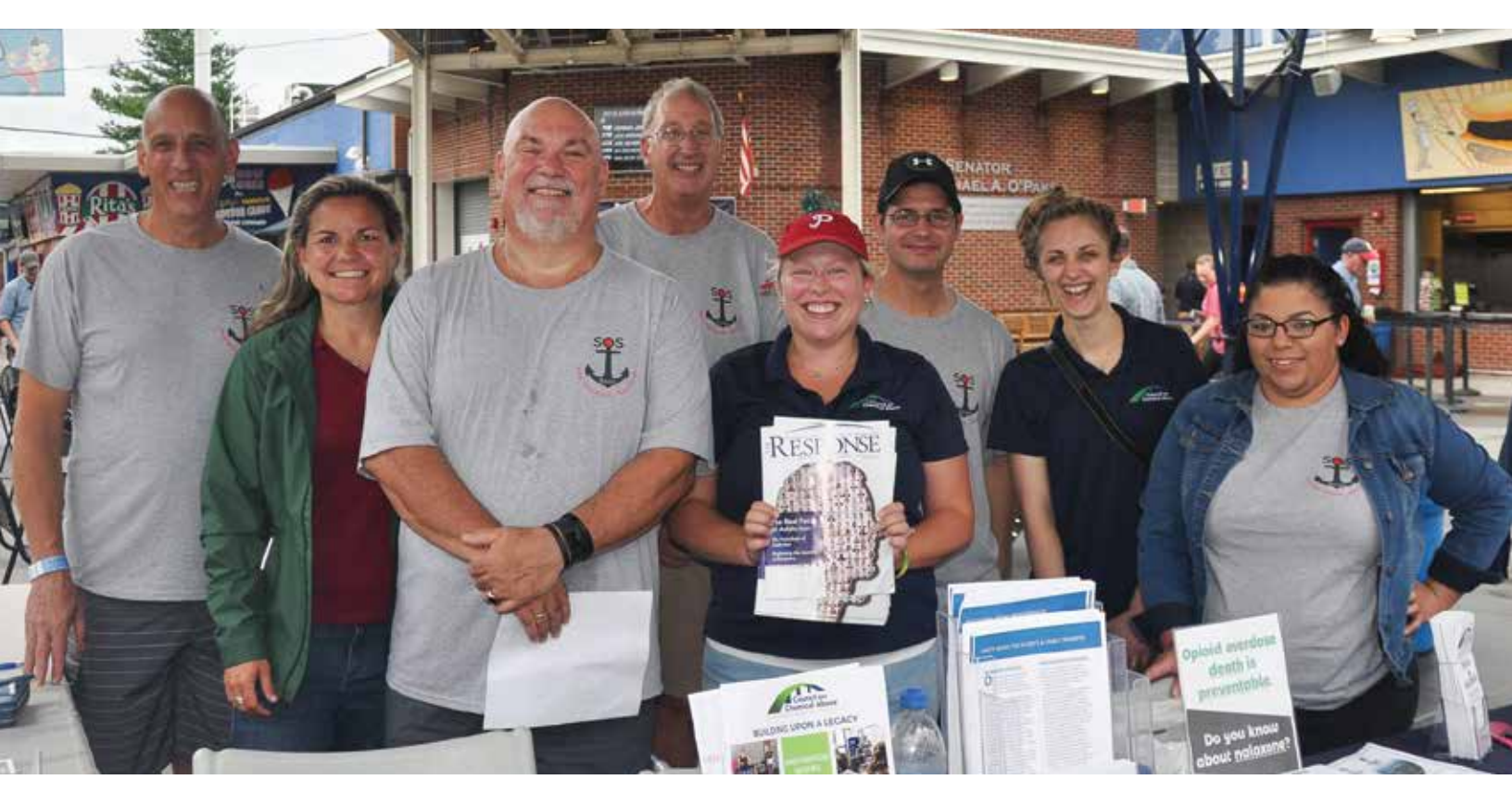
SOS Berks committee members helped out at the Opioid Awareness Night event with the Reading Fightin' Phils at First Energy Stadium.

Like many communities across our country, Berks County is in the grip of an unprecedented opioid epidemic. Berks County recognizes the responsibility to respond to this epidemic. Over the past year, the Berks Opioid Coalition, comprised of over seventy plus key decision-makers, has moved forward in its mission to save and improve the lives of Berks County residents. The Coalition has selected the brand name of SOS Berks - Stop Overdoses... Save Lives. SOS is the international code signal of extreme distress. By embracing the SOS Berks brand, the Coalition acknowledges the severity of this crisis and its responsibility to be a "life preserver" for Berks County residents.