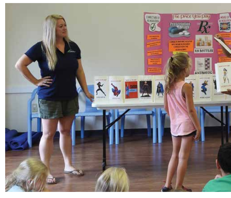
Prevention staff teaches about prescription medication safety during a summer program.

YLAP is a program aimed to help communities create tobacco-free parks, playgrounds and recreational areas for children. Berks County municipalities are encouraged to join in eliminating children's exposure to secondhand smoke at places children play. YLAP supports community efforts to protect the environment and the health of all residents, particularly our youth. Five locations were added during FY 17/18.