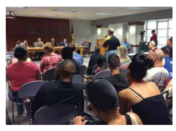
Every September, members of the Berks County community gather to share stories of recovery from addiction at a Commissioners' Meeting.

In November 2017, dozens gathered for Esperanza para Berks at the DoubleTree in downtown Reading. The event encouraged conversation about addiction and the resources available.