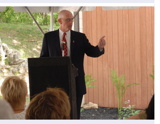
Kevin Barnhardt, Berks County Commissioner, addresses attendees during the dedication ceremony.