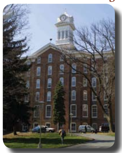
Old Main, Kutztown University

Serving as the coordinating coalition of a four year strategic plan, the President's Roundtable is actively working to reduce the risks of alcohol use by young adults under the age of 21. The second year of activities included an array of prevention and intervention efforts. The campaign was developed by students focusing on the misconceptions of alcohol use by college students. Evidencebased screening and intervention services were also implemented as a means of assisting students who are concerned about their drinking. Finally, a series of educational programs were offered to keep students updated on current substance abuse