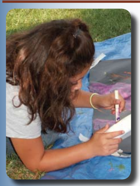
Natural High presentation at Laureldale Playground Program - Summer 2010

The Council on Chemical Abuse prevention programs are designed to reduce those factors that place our youth at risk for alcohol, tobacco, and other drug use. The Council actively engages both youth and family members in a variety of prevention activities in both school and community settings.