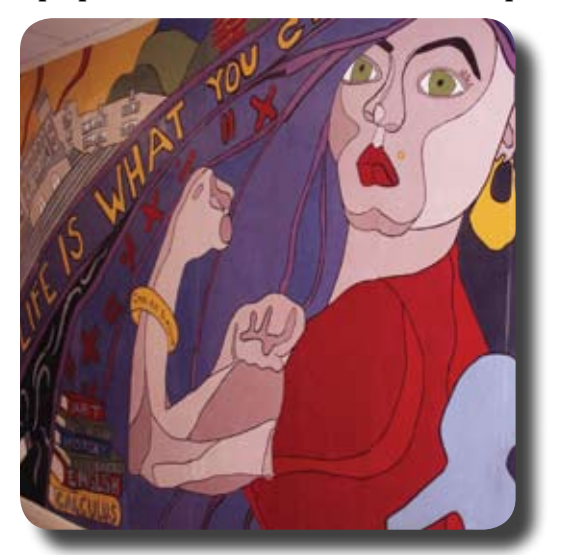
The student's mural encourages peers to make healthy choices.

The students designed the mural to discourage a growing graffiti problem and to increase student ownership of promoting healthy messages within the school. The mural depicts a strong young woman who is in the process of determining her future. The phrase, "Your life is what you choose, choose success," is depicted on the mural to encourage students to make healthy choices. Over 100 students helped with the design, preparation, and installation of the piece.