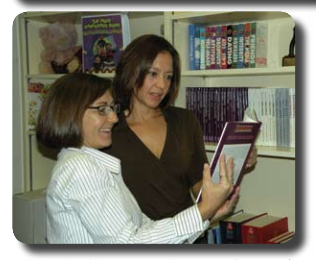
The Council's Addiction Resource Library is an excellent resource for anyone interested in drug and alcohol prevention, treatment, or recovery.

- Teacher, 13th and Union Elementary School